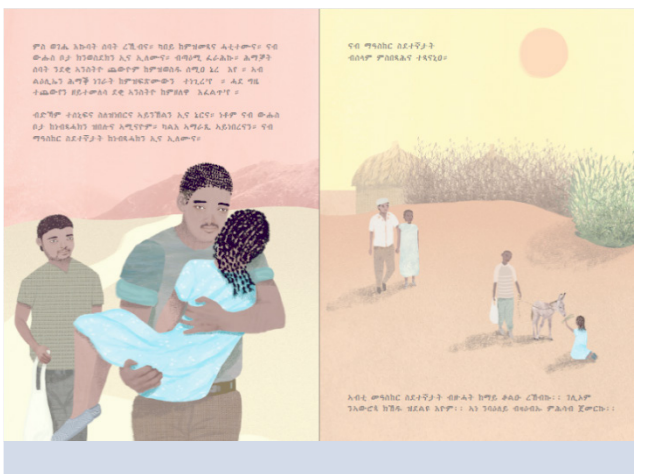
Figure 4 : Still image from a Tigrinya children's book produced by UNHCR

Although the materials generated through the campaign are extremely compelling, and the effort has been applauded for foregrounding the voices of members of the diaspora, there are concerns (Schans and Optekamp, 2016) that the campaign's web-based platform may not be the best means of engaging potential migrants in local communities in the Horn of Africa. Critics have also questioned the role played by