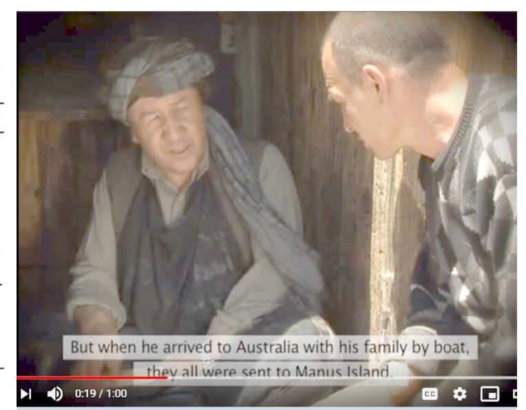
Figure 3 : Still image from a 'By boat, no visa' campaign video aimed at Afghani asylum-seekers

Aiming to raise awareness among diaspora communities, the Australian Department of Immigration and Border Protection (DIBP) contracted with the PR agencies Y&R Group and Diverse Communications. The campaign was produced in six languages, using both online and offline messaging, and included spots from prominent celebrities including Sri Lankan cricketers Muttiah Muralitharan